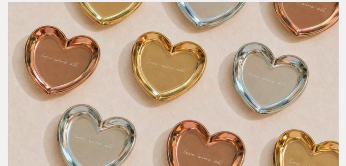
Heart Trinket Tray (Gold, Rose Gold or Silver)