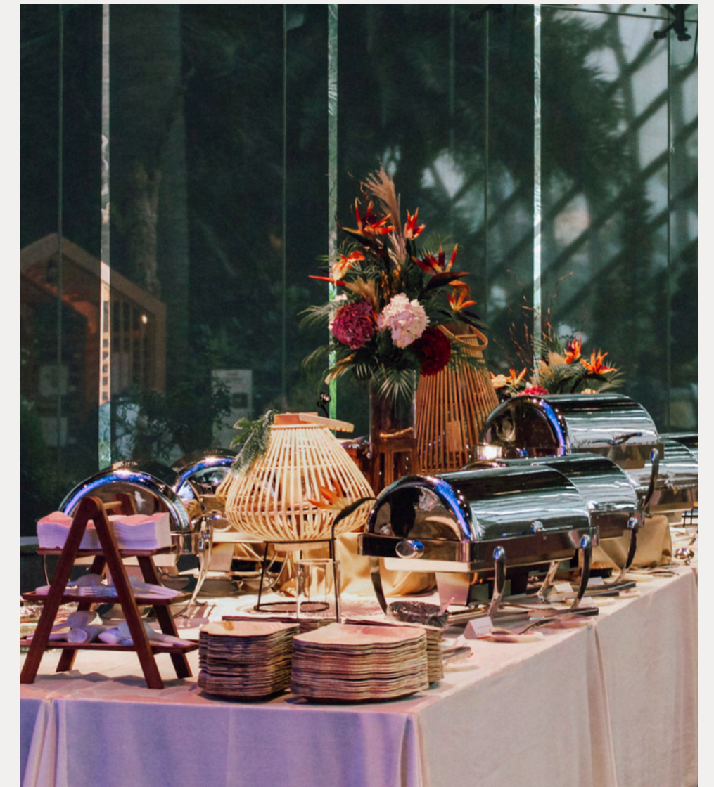
Buffet & Live Stations