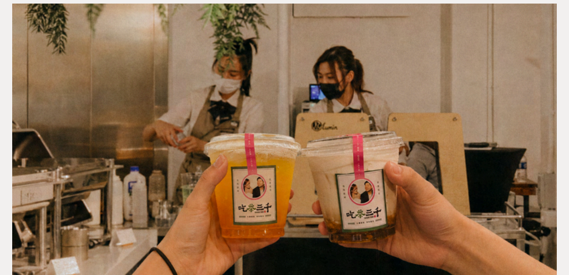
CHICHA Live Station