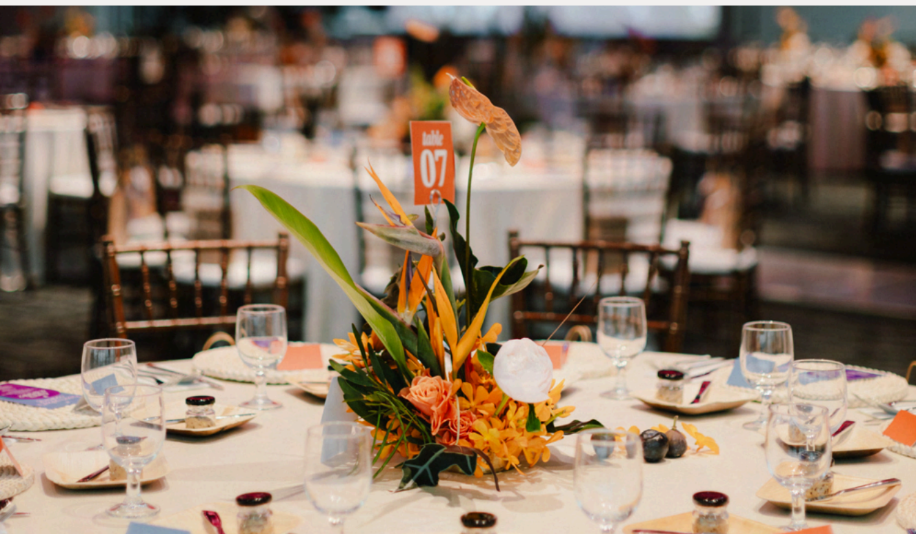
TROPICAL PARADISE sit-down, wedding