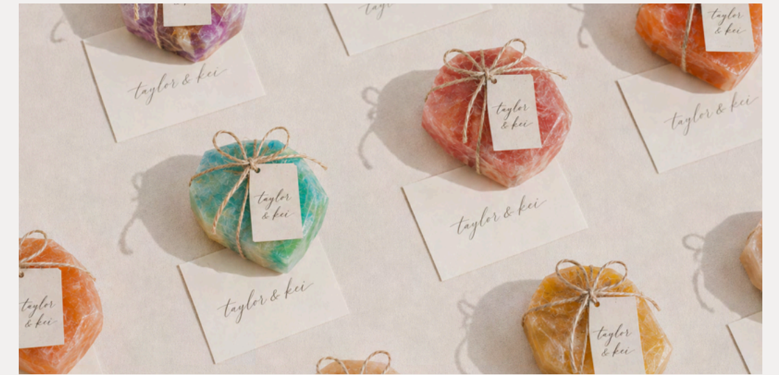
Crystal Gem Soap Bars