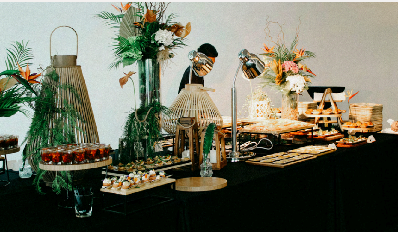
TROPICAL PARADISE buffet, corporate