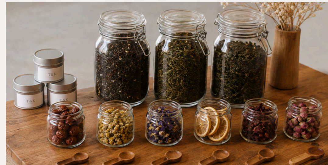
Decorated Tea Bar