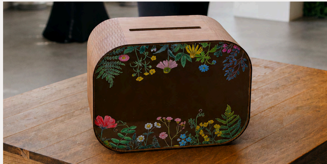
Keepsake Ang Bao Box