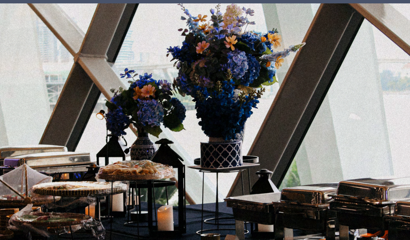
MOONLIT SERENITY buffet, corporate