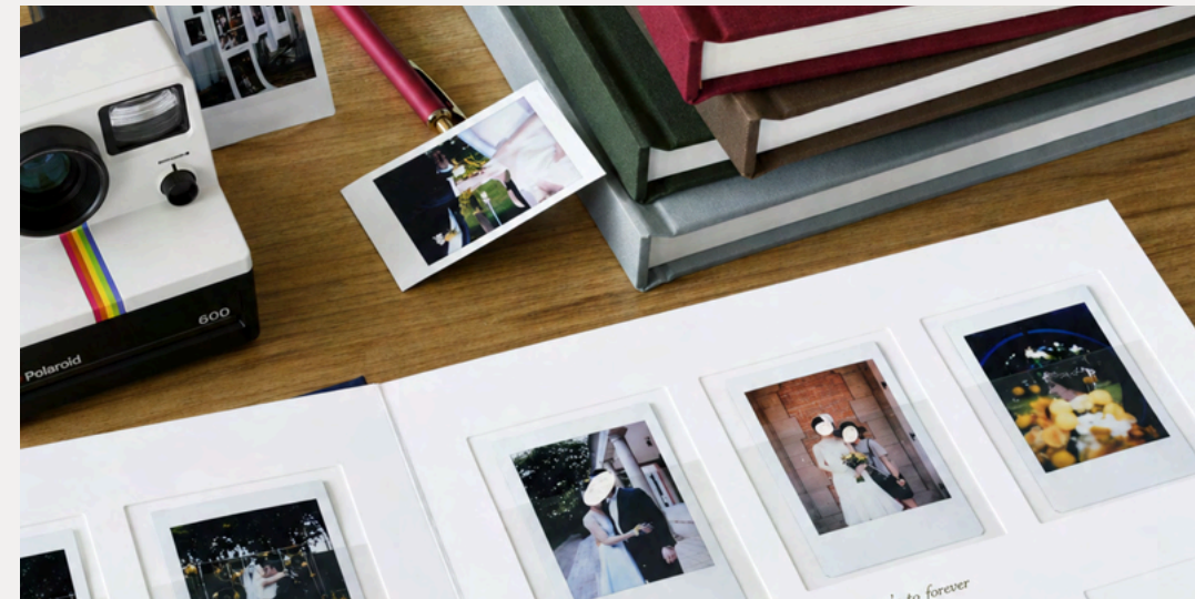
Guestbook with Polaroid Camera Rental & Film