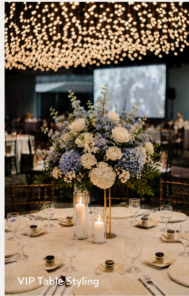
VIP Table Styling