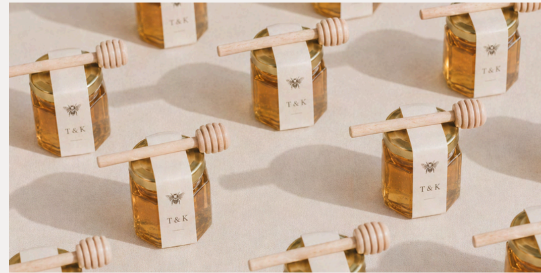
Sweet Honey Jars