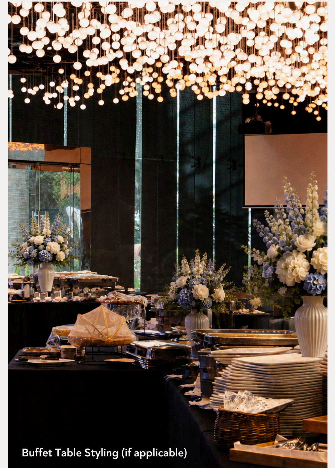
Buffet Table Styling (if applicable)