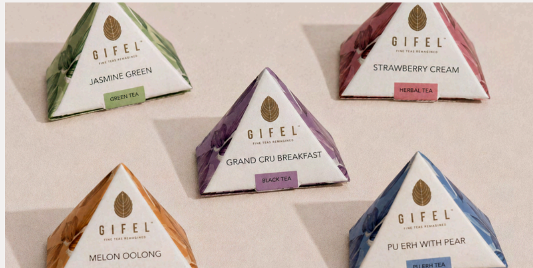
Pyramid Tea Favours