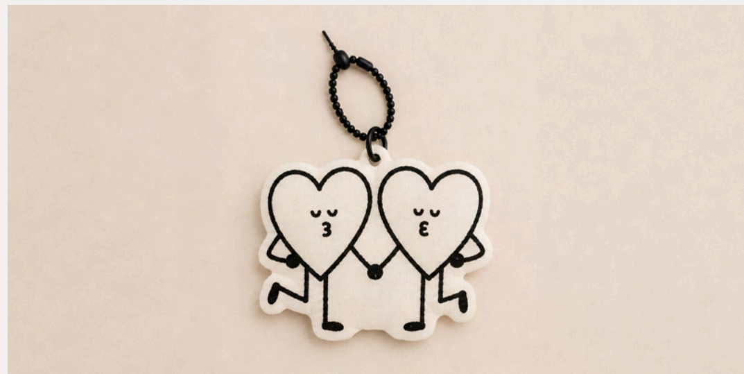
Couple's Story Plush Charm