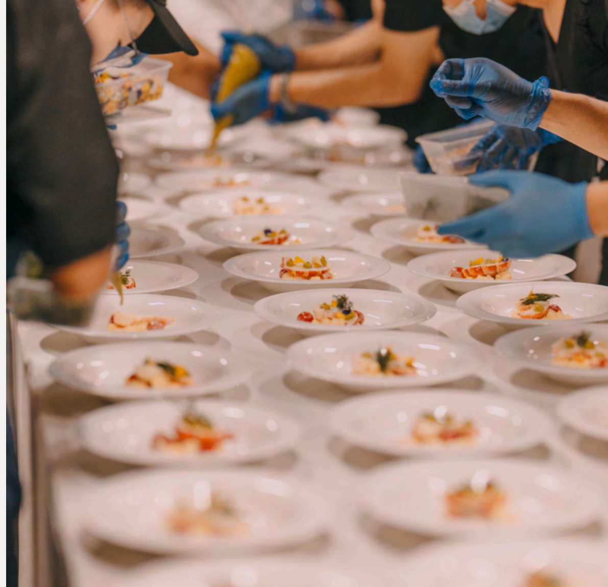
Individually Plated, Sit-Down, Fusion Menu