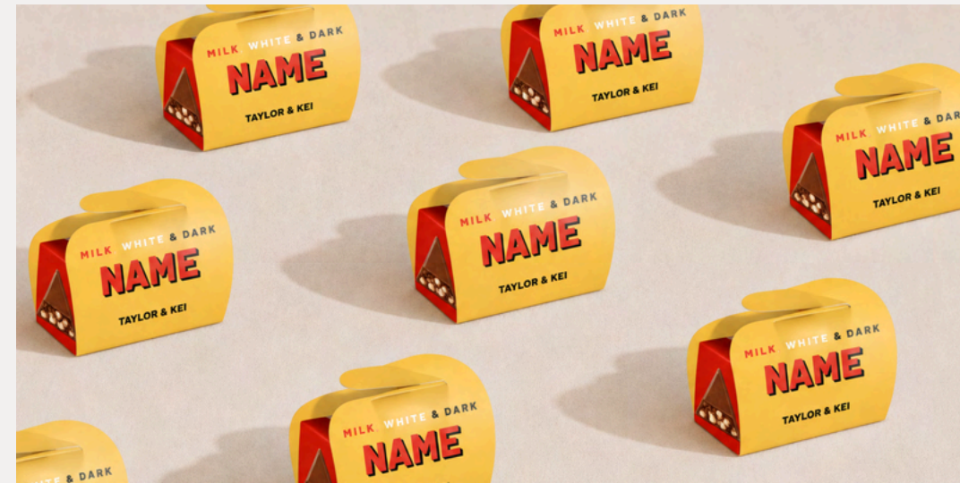
Personalised Toblerone Treats