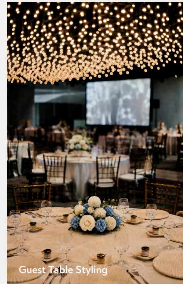
Guest Table Styling