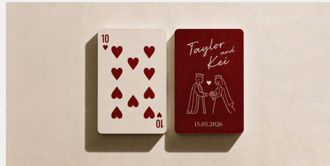
Perfect Match Playing Cards