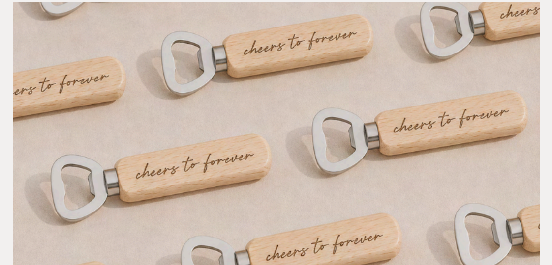
Keepsake Bottle Opener