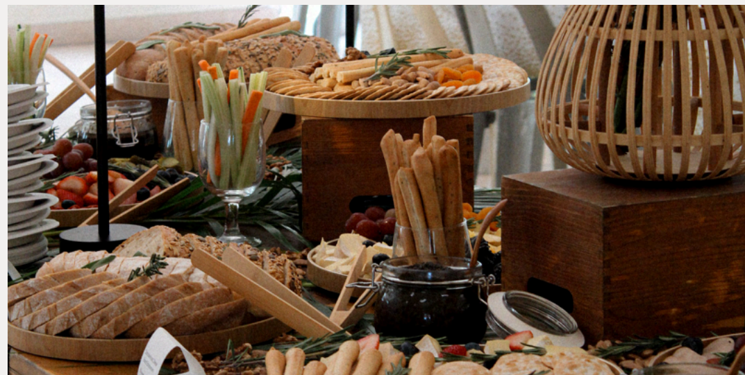
Charcuterie and Cheese Board Grazing Table