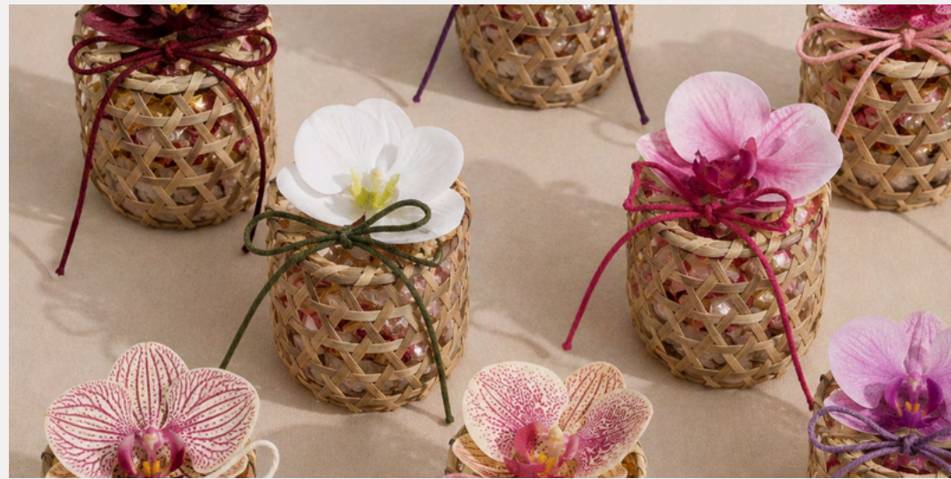
Mini Orchid Baskets