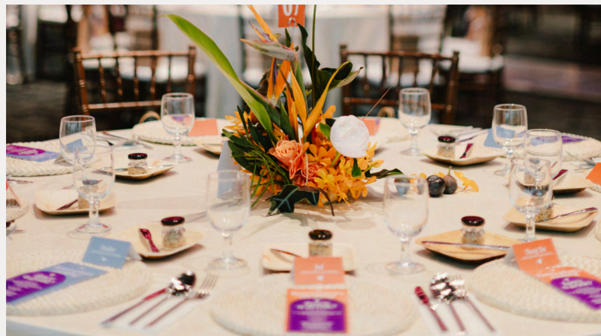
Chinese Communal Banquet, Sit-Down